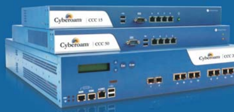
CCC Series : CCC15, CCC50, CCC100, CCC200, CCC500 and CCC1000

The CCC Log Viewer offers logs and views of administrator actions on CCC as well as dispersed UTM appliances. Email alerts can be set based on expiry of subscription modules, excess disk usage, IPS and virus threat counts, unhealthy surfing hits and other parameters.